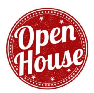
OPEN HOUSE JUNE 9