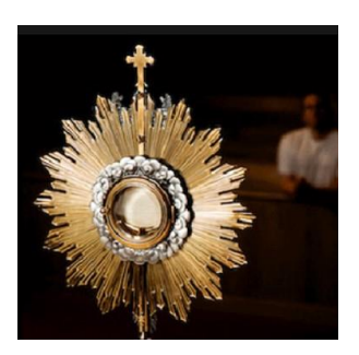
HOLY HOUR JUNE 18