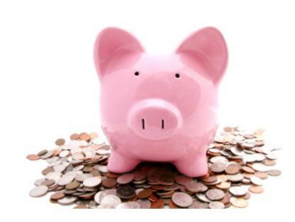
COIN DRIVE JUNE 18